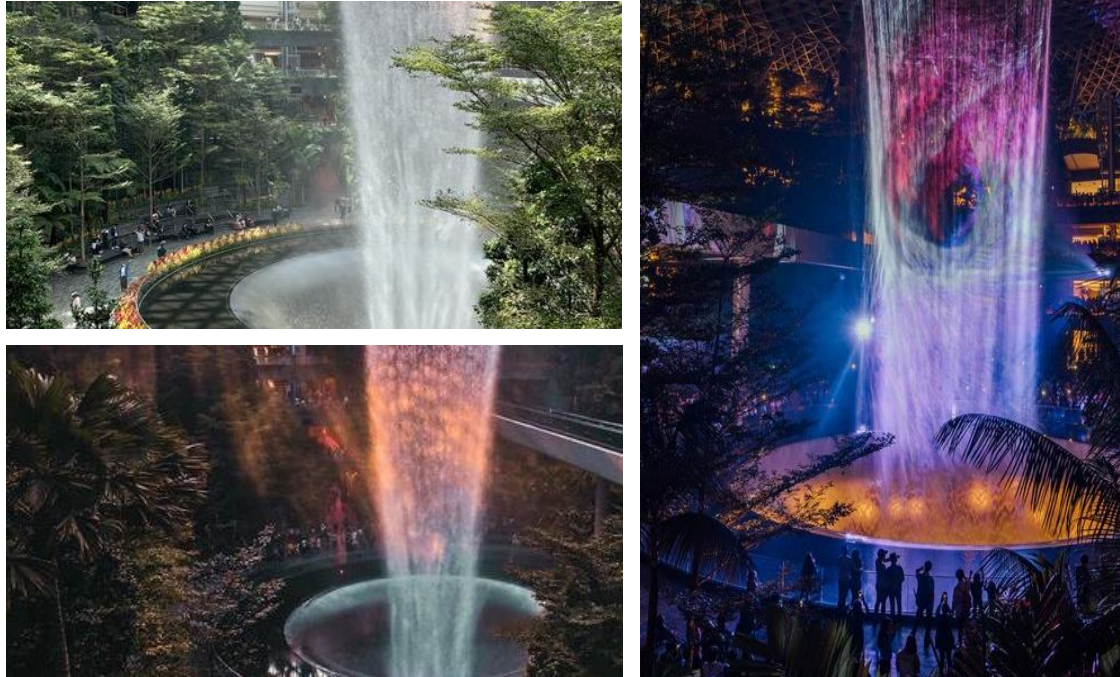
Reference image : the combination of water curtain film and environmental change